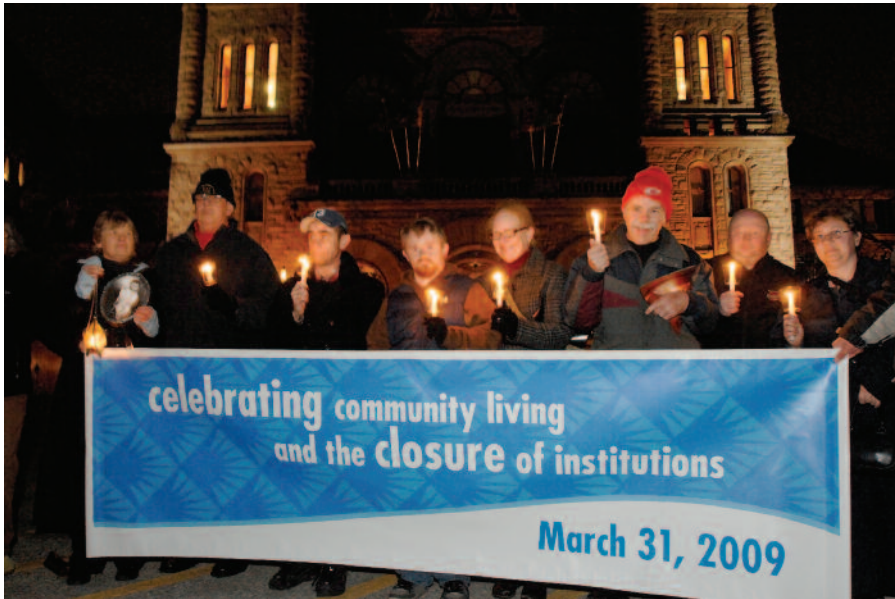
Ontario Vigil, March 2009

After the final three institutions were closed in March of this year Community Living Ontario's Deinstitutionalization Working Group held a retreat to look at the challenges that lie ahead. There is still much unfinished business in Ontario related to institutionalization including: ensuring that people living in other forms of institutions (long term care facilities etc.) have the opportunity for real community life; ensuring that community programs and supports are not re-creating institutional models in community; promoting a comprehensive history of the institutionalization movement;