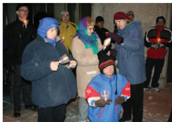
Vigil at Manitoba Legislature

On December 3rd, 2009, People First of Canada and many of its chapters around the country were involved in events to mark the International Day of Persons with Disabilities. A vigil was held in Manitoba, and several screenings of The Freedom Tour were held in the Yukon, along with a panel discussion around deinstitutionalization.