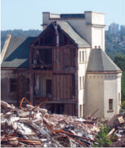
Centre Block, former Woodlands Institution

On a recent visit to Campbell River and in meeting with the Campbell River and District Association for Community Living (CRADACL), representatives of the BC Association for Community Living had the opportunity to experience first hand the changes that have been incorporated into the plans for the new project that was announced last April. While it was initially announced that this new project would include '24 residential units' for people with intellectual disabilities, the most recent plans are for three one-story townhouse buildings with eight, one- and two-bedroom suites in each. The local ACL will support three to four people with intellectual disabilities in one of the eight-unit townhouses and will rebuild an existing four-bed group home on the site. The Campbell River and North Island Transition Society will operate the other two buildings, providing services to women and children dealing with issues of abuse and violence. In addition, the site will feature a community kitchen and gathering space that will be open to the larger community as a place for gathering and activities.