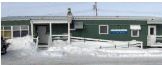
Group Home in Rankin Inlet, Nunavut

There are currently no large institutions designed specifically for persons with intellectual disabilities in the Territory of Nunavut. People who have returned from Nunavut from institutions are for the most part living in group homes. There are still, however, many people living in institutions in the South, who have not yet been assisted to move back home. We are not aware of any formal plan to assist in their repatriation.