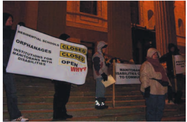
Demonstration at Manitoba Legislature

Since the filing of the Human Rights Complaint in September 2006 on behalf of persons living at the Manitoba Developmental Centre (MDC), a variety of efforts to create community living options have taken place. The Joint Government / Community Transition Advisory Committee has received updates on the developing plans for persons targeted for moving into the community under an accelerated plan. Most recent information indicates that since April 2009 13 people have moved with an additional 15 people identified as being involved in an active planning process.