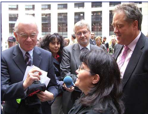
ENIL hands a petition to the European Parliament President Hans-Gert Pöttering.

In the afternoon, all the representatives of the different countries organised meetings with their National MEPs in different parts of the Parliament building. There was also a special meeting arranged with the Portuguese MEPs, as Portugal was holding the EU Presidency. Many of these meetings instigated lively discussions between MEPs and activists covering issues ranging from the new UN Convention and its ratification, the EU structural funds and how these could be used for capacity building and empowerment of Independent Living organisations, to other issues related to the European legislation and Directives, and the importance of Independent Living and Personal Assistance for disabled people.