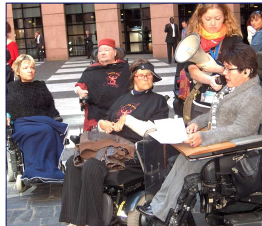
Freedom Drivers address MEPs in the lobby of the European Parliament.

What we hope is that some of the disabled people now living in institutions will be able to join one of the next Freedom Drives and come to speak to you, just like we are today. For now, support services like personal assistance and direct payments are still a far cry from reality in those European countries where disabled children and adults have no choice but to spend their lives in an institution.