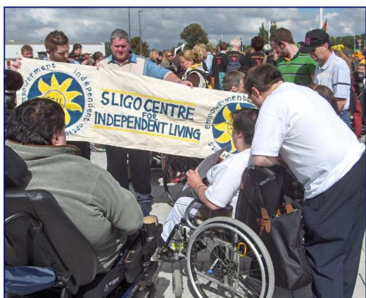
Freedom Drivers in the streets of Strasbourg.

This means that, once they ratify the Convention, countries will have the obligation to make community-based services available and accessible to all people with disabilities. This, in turn, will avoid the need for people to be admitted to institutions and lead to their closure. It is therefore crucial that the Convention enters into force as soon as possible - for which at least 20 ratifications are needed - so that its provisions can be implemented in practice as a matter of priority.