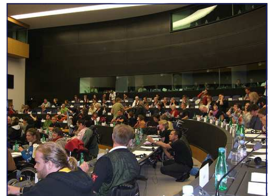
Meeting of the European Parliament Disability Intergroup.

Following the conclusion of the Included in Society project, a group of disability organisations - among them ENIL, Inclusion Europe, the European Disability Forum, the Open Society Mental Health Initiative, Mental Health Europe, Autism Europe and the Center for Policy Studies at the Central European University - established the European Coalition for Community Living. Our main objective is to make sure that quality community-based services for all people with disabilities are developed as a matter of priority in all the European countries. This is the only way people with disabilities who now live in institutions or at home, but without the support they need, will be able to live in the community, with the same opportunities as other citizens.